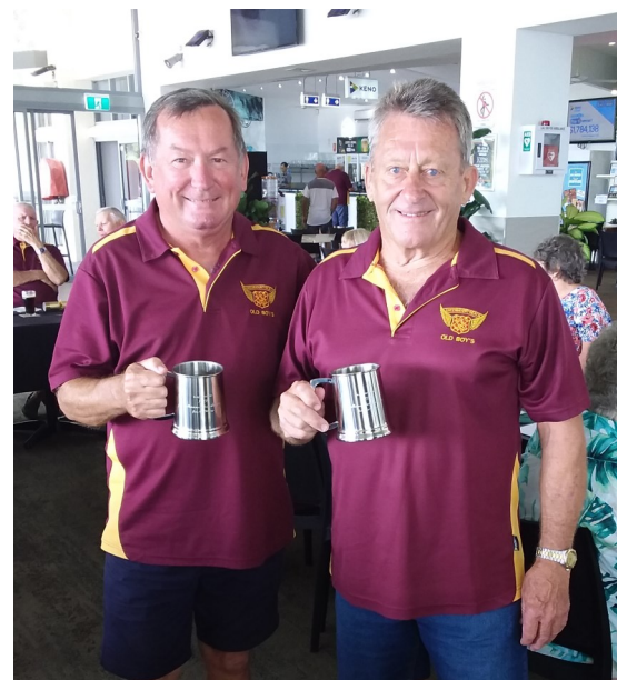
Photo with Engraved Beer Steins - presented at our O'Boys Xmas Luncheon at the GBC.