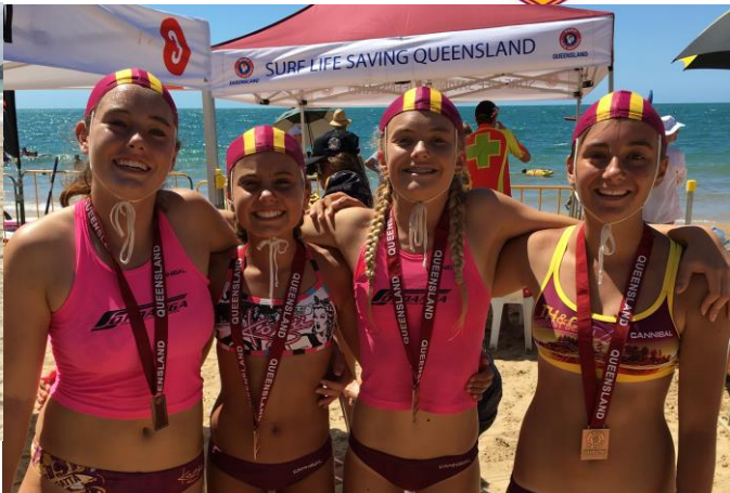
Under 11's to 15's