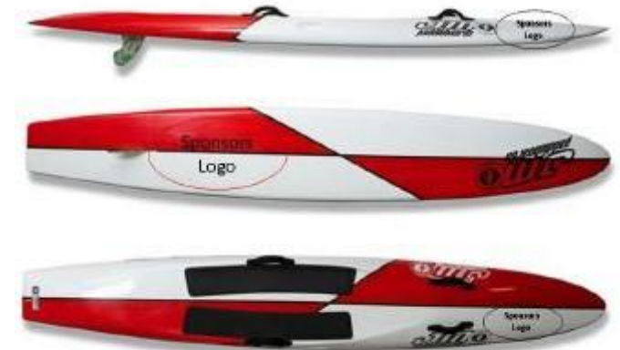
10'6 SLSC Racing Mal